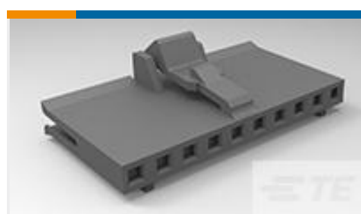
TE Part # 1-487526-5 016 HOUSING FFC RCPT 100CL SR