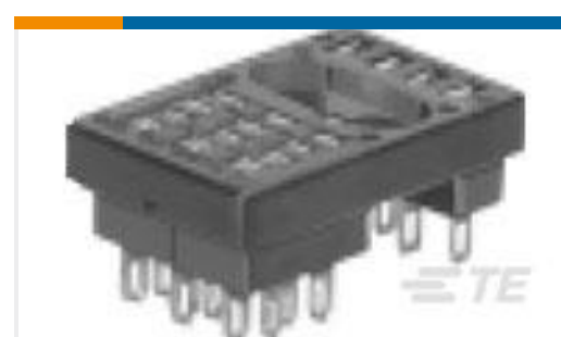
TE Part # 1393143-8 27E125=SOCKET,R10,10,SLG,PHE