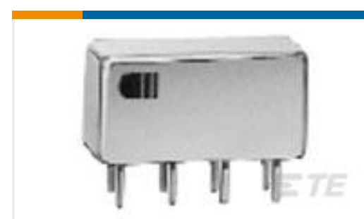
TE Part # 3-1617029-2 HFW1131K04 = M39016/6-107L