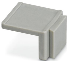
Equipment marker, narrow

Phoenix Contact 2024 © - all rights reserved https://www.phoenixcontact.com