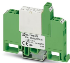
Relay module, with soldered-in miniature switching relay, contact (AgNi): medium to large loads, 1 changeover contact, input voltage 24 V DC, design rotated 180°

Please be informed that the data shown in this PDF document is generated from our online catalog. Please find the complete data in the user documentation. Our general terms of use for downloads are valid.