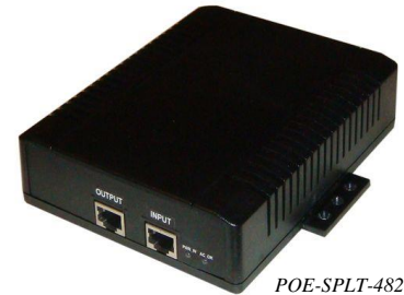
POE-SPLT-4824AC-GBT PoE Converter/Splitter