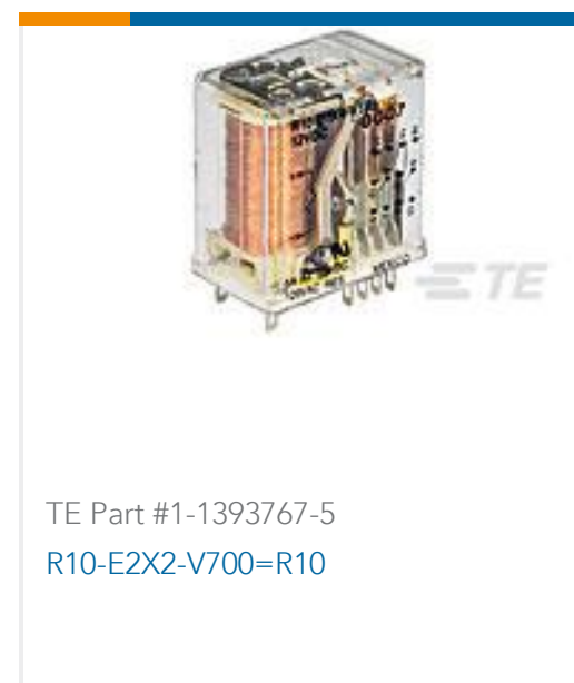
TE Part #1-1393767-5 R10-E2X2-V700=R10