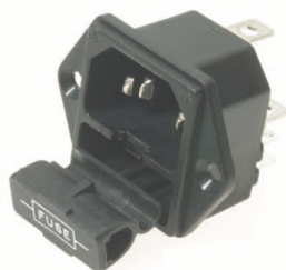
MS-3 with Fuse Carrier