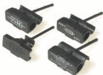
MS-3 Printed Fuse Carriers