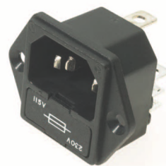
MS-3 with Voltage Selector