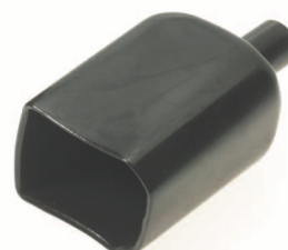
PVC Insulating Cover

The CLIFF MS-3 series Power Input Connectors are produced from heat resistant plastic with solid brass nickel-plated metal parts. Parts for soldering are tin plated. The MS-3 is a composite design incorporating an input, fuseholder and voltage selector. The fuse carrier is available printed with various voltage combinations. Two terminal options are available – Solder Tag and Quick Connect. All products are produced in accordance to IEC320 / EN60-320 and have various safety approvals. The standard colour is Black, however some products are available in other colours, subject to a reasonable order quantity. For voltage selector options, refer to drawing number CL19262. Supplied without fuse fitted.