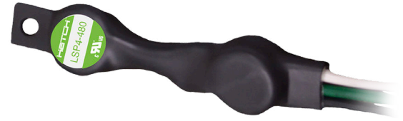
Field or Factory Installable