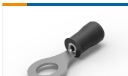
TE Part # 320553 PIDG Ring Tongue Terminals