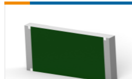
TE Part # 3-2176403-8 3550 36R 1%