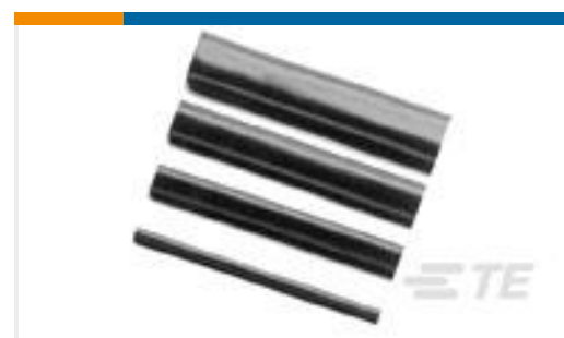
TE Part # CL0859-000 SST-48-04/FR/97