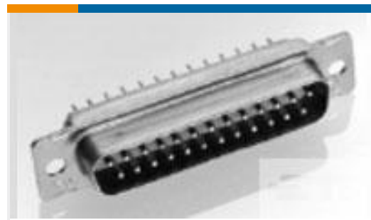
TE Part # 1757819-7 AMPLIMITE, ASY, PLUG, STD, 109, ZN, 2, CT