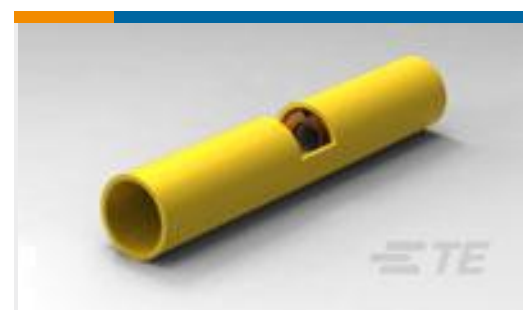
TE Part # 320570 SPLICE BUTT PIDG 12-10