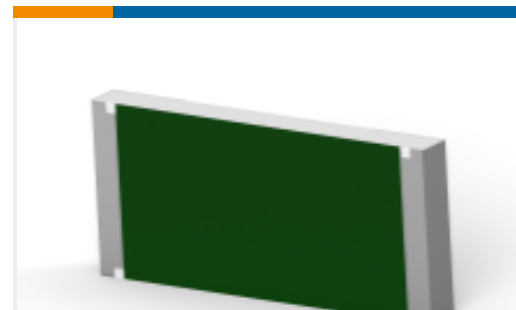
TE Part # 8-2176404-6 3550 18R 5%