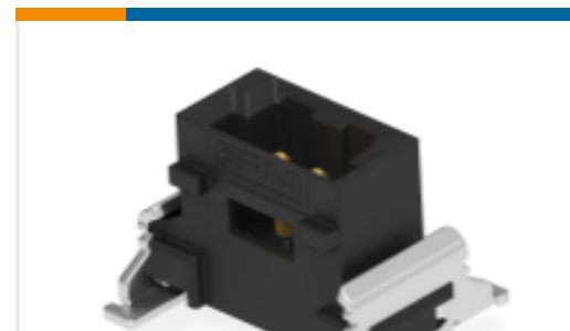
TE Part # 464124-E SRCP 1,27 2 M 1 SMD 137 E1 105 * GUH *