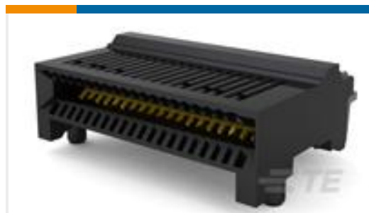
TE Part # 1551920-2 zQSFP+ connector assembly