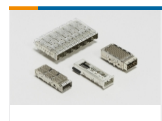
Pluggable IO Connectors & Cages(424)