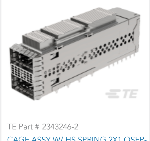
CAGE ASSY W/ HS SPRING 2X1 QSFP-DD