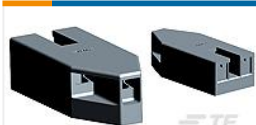
TE Part # 360052-1 125 DIA CLSTR BLK