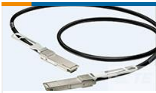
TE Part # 2829040-8 QSFP IB EDR, 26AWG, 3.0M