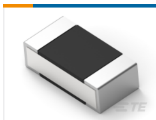
TE Part # 3-2176307-3 RP 1E 0.1W 26K7 0.1% 25PPM 5K RL