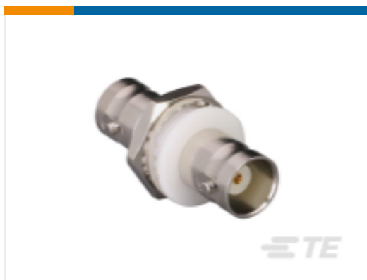
TE Part # ADP-BNCF-BNCF-B BNC Jack to BNC Jack Bulkhead