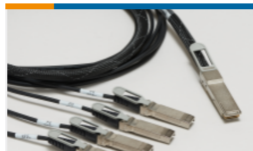
TE Part # 2821033-8 QSFP TO [4]SFP+, 28G, 1M, 33AWG