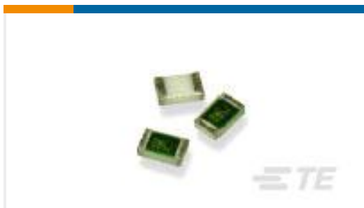
TE Part # 9-1879215-1 CPF 0402 40K2 0.1% 25PPM 1K RL