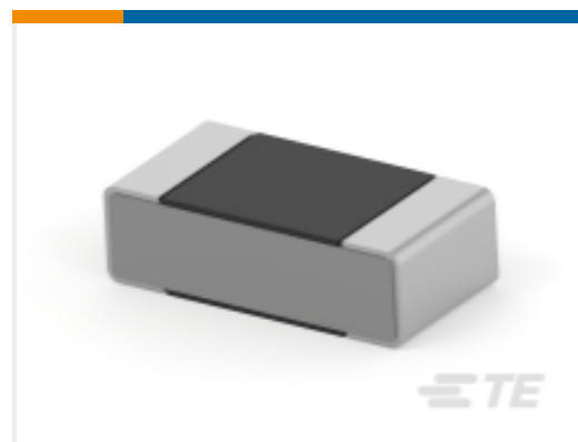
TE Part # 2176263-5 RN 0402 26K7 0.1% 10PPM 5K RL