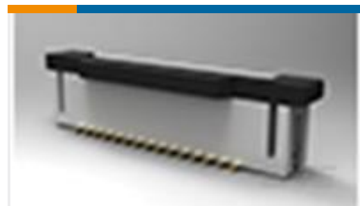
TE Part # 1734248-8 1.0 FPC, ZIF V/T, SMT, 8P