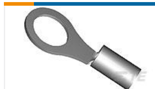
TE Part # 321895 SOLIS R HT 22-16COMM22-18MIL 8