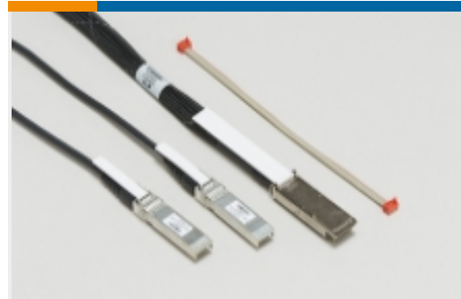
Pluggable I/O Cable Assemblies(19)