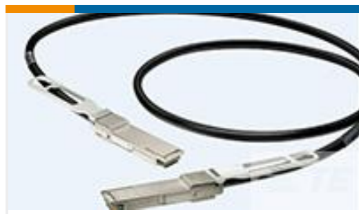
TE Part # 2829040-8 QSFP IB EDR, 26AWG, 3.0M