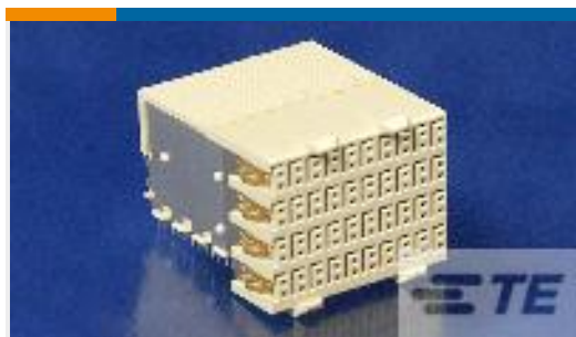
TE Part #2065657-1 zd Plus, 4 pair, receptacle assy