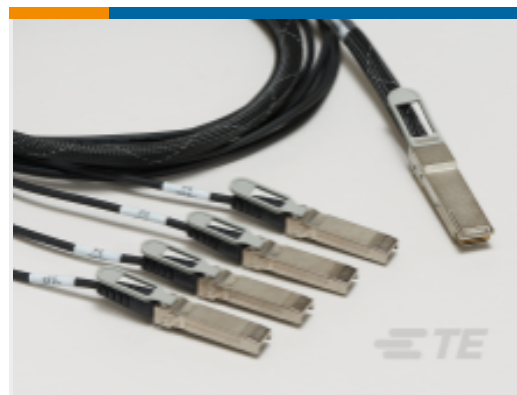
TE Part # 2821033-8 QSFP TO [4]SFP+, 28G, 1M, 33AWG