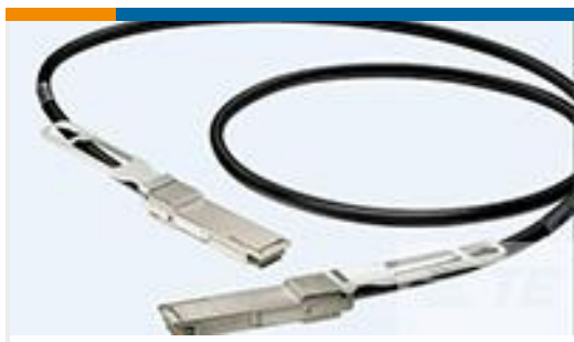
TE Part # 2829040-7 QSFP IB EDR, 26AWG, 2.0M