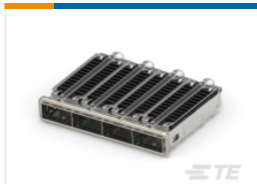
TE Part # 1-2170287-1 1X4 CAGE ASSEMBLY, QSFP, SINGLE SQ LP