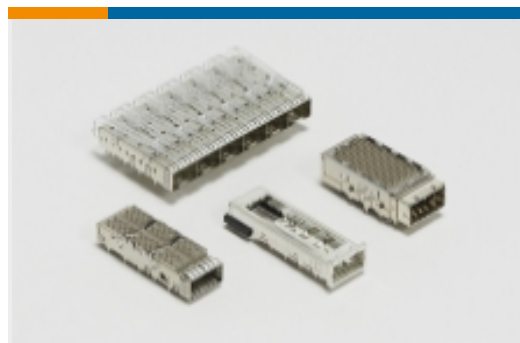
Pluggable IO Connectors & Cages(53)