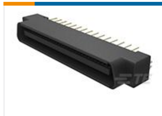
TE Part # 1734100-3 Champ050 series, 30pos, Au over PdNi