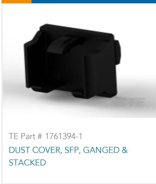
TE Part # 1761394-1 DUST COVER, SFP, GANGED & STACKED