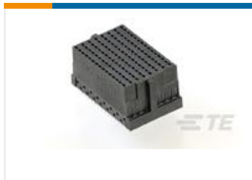
TE Part # 1934949-1 Tinman 5pr 8col vert recpt 15mm stack