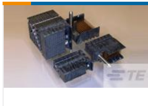
TE Part # 2007808-2 IMP100S, H, V4P10C, LG, OEW46, 4.9