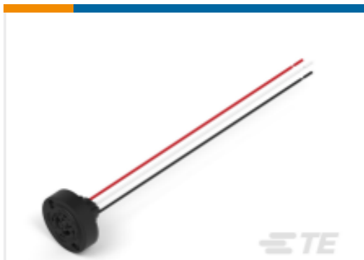
TE Part # 6-2213362-2 RCPT ASSY, DIMMABLE PHOTOCONTROL, 150C, 3 P