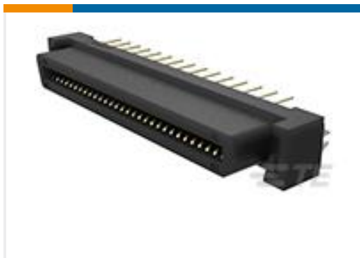
TE Part # 1734101-3 Champ050 series, 30pos, Au over PdNi