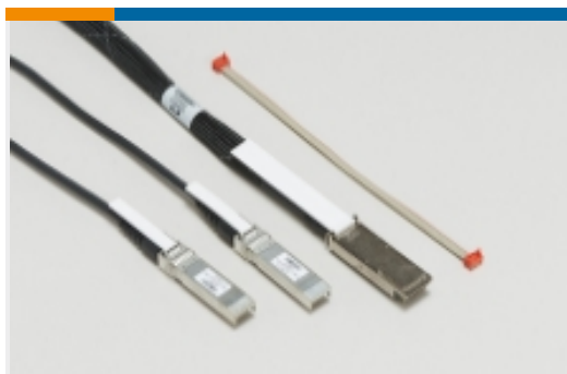
Pluggable I/O Cable Assemblies(17)