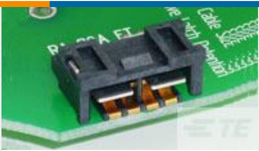
TE Part #1982295-6 ELCON MINI 2P RA HEADER, GOLD, W/O CODING