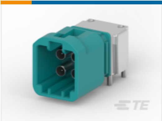
TE Part #2304168-9 4P MATE-AX, HDR ASSY, 90 DEG, COD Z