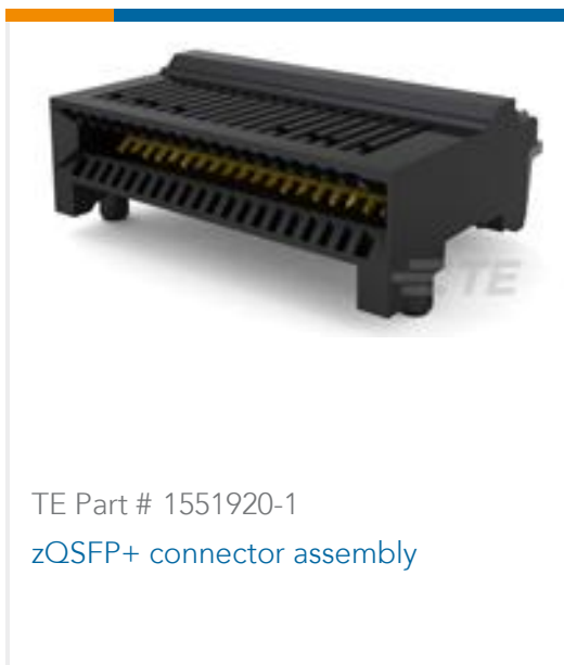
TE Part # 1551920-1 zQSFP+ connector assembly