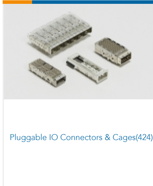
Pluggable IO Connectors & Cages(424)