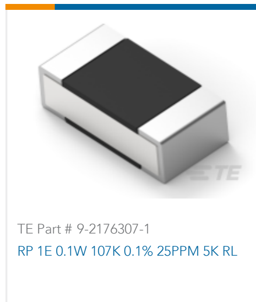
TE Part # 9-2176307-1 RP 1E 0.1W 107K 0.1% 25PPM 5K RL