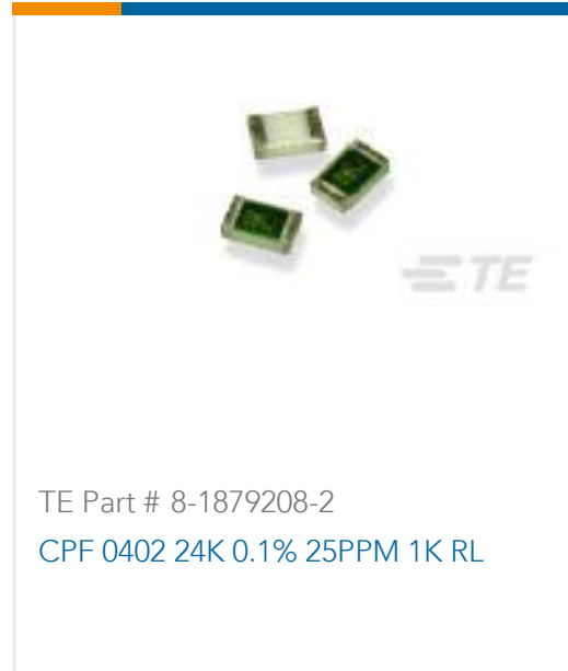
TE Part # 8-1879208-2 CPF 0402 24K 0.1% 25PPM 1K RL