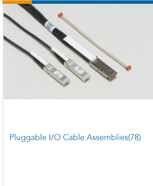
Pluggable I/O Cable Assemblies(78)