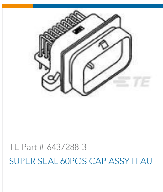
TE Part # 6437288-3 SUPER SEAL 60POS CAP ASSY H AU