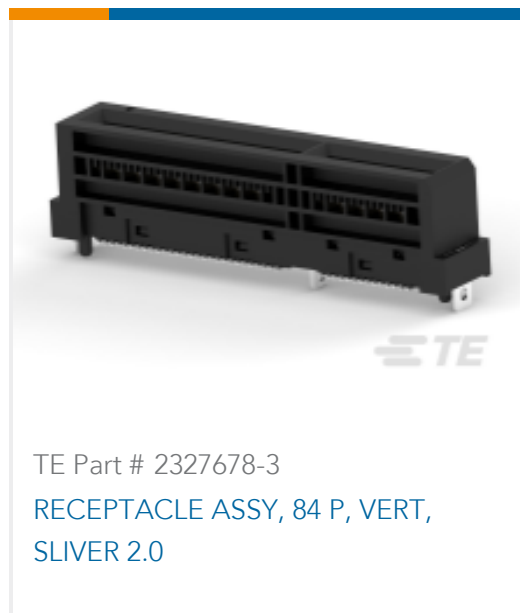
TE Part # 2327678-3 RECEPTACLE ASSY, 84 P, VERT, SLIVER 2.0