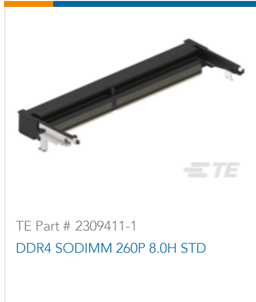
TE Part # 2309411-1 DDR4 SODIMM 260P 8.0H STD