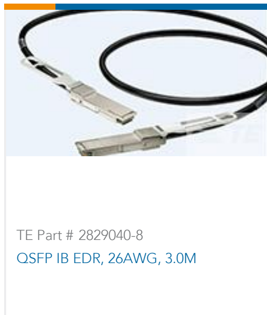
TE Part # 2829040-8 QSFP IB EDR, 26AWG, 3.0M