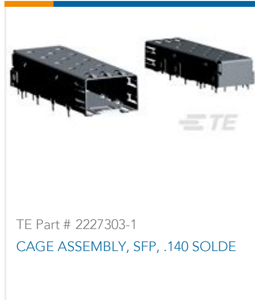
TE Part # 2227303-1 CAGE ASSEMBLY, SFP, .140 SOLDE