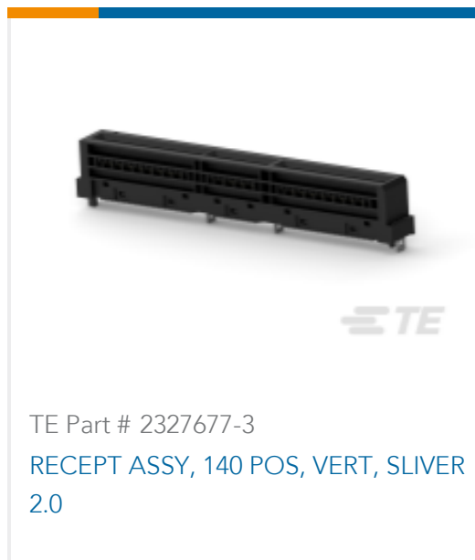
TE Part # 2327677-3 RECEPT ASSY, 140 POS, VERT, SLIVER 2.0