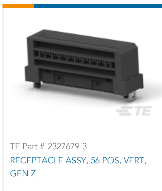
TE Part # 2327679-3 RECEPTACLE ASSY, 56 POS, VERT, GEN Z