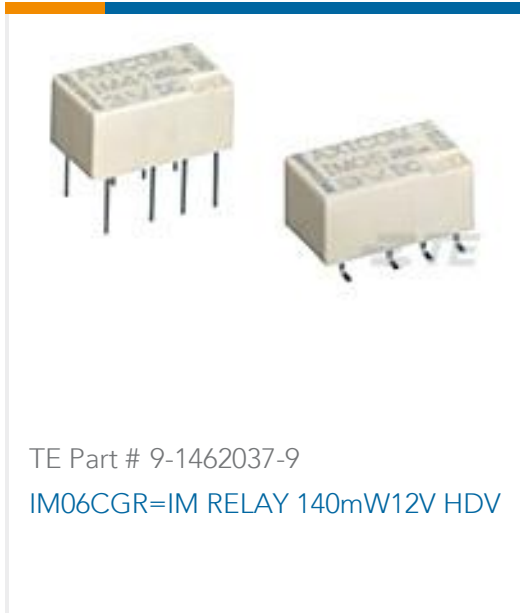
TE Part # 9-1462037-9 IM06CGR=IM RELAY 140mW12V HDV