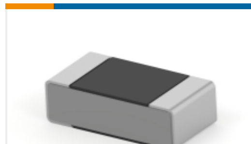
TE Part #2176263-3 RN 0402 25K5 0.1% 10PPM 5K RL