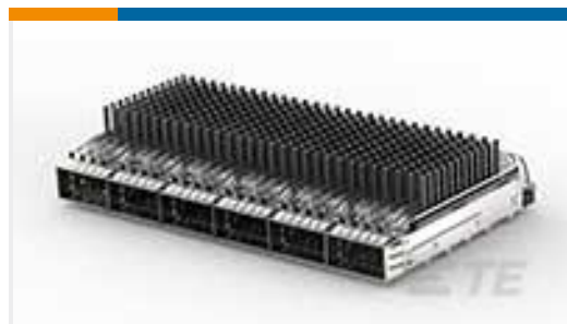
TE Part #4-2170708-3 CAGE ASSY, 1X6, QSFP28, SPRING, HS, LP