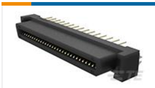
TE Part #1-1734101-4 Champ050 series,160pos,30u"Au