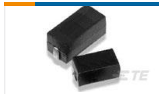
TE Part #4-1879233-7 SMW5 8R2 5%