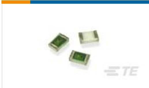
TE Part #1-2176089-5 RP 1J 0.166W 15K4 0.1% 25PPM 1K RL