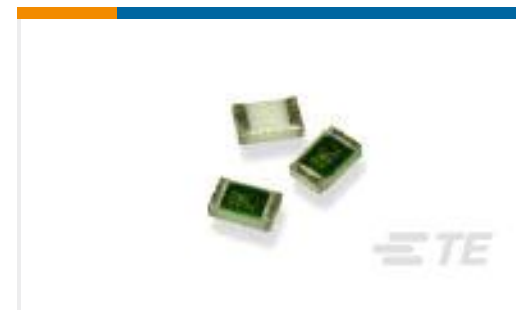
TE Part #2-1879338-3 CPF 0603 45K3 1% 50PPM 1K RL