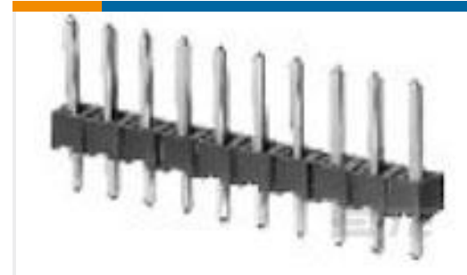
TE Part #5-146274-9 09 MODII HDR SRST B/A .100CL