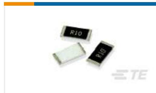
TE Part #2-1879462-4 RL73H 2B R15 1% 1K RL