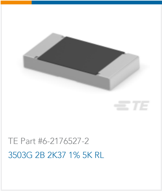
TE Part #6-2176527-2 3503G 2B 2K37 1% 5K RL