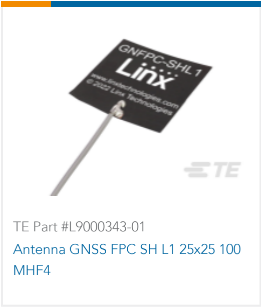
TE Part #L9000343-01 Antenna GNSS FPC SH L1 25x25 100 MHF4