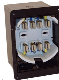
3. Retrofit Panel Adapter Installed