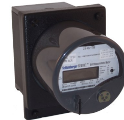
4. Installed with Sentinel meter & cover