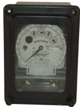
1. Old Meter in Panel