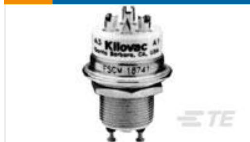
TE Part # 5-1618274-5 HC-5=RELAY, PRESSURIZED, SPDT