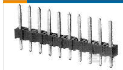
TE Part # 826629-5 AMPMODU II HEADER