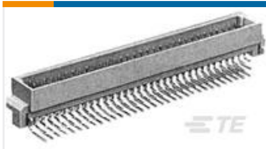
TE Part # 5650473-5 ASSY,PIN,EUROCARD,TYPE C,LEAD-