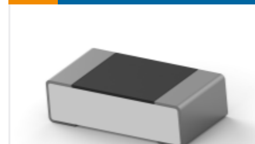
TE Part # 2-2176369-7 RQ 0603 75R 0.1% 10PPM 5K RL