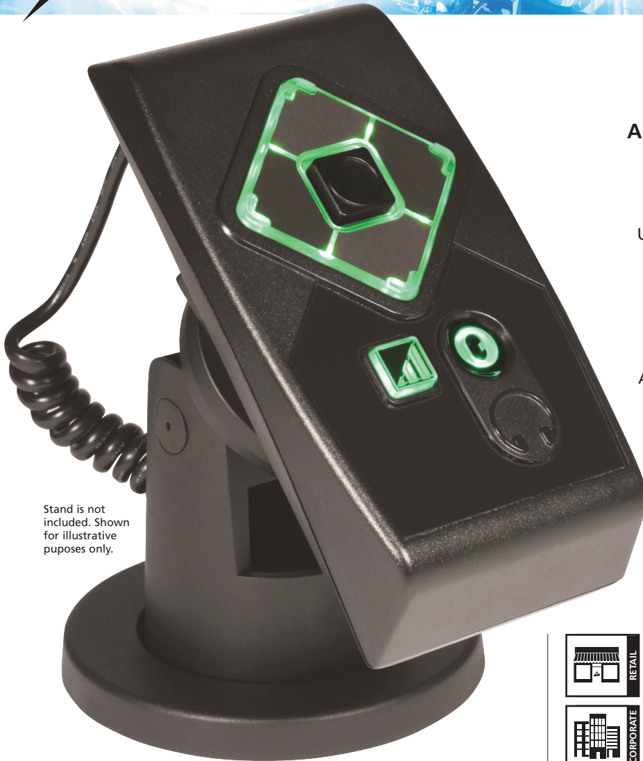
Stand is not included. Shown for illustrative purposes only.