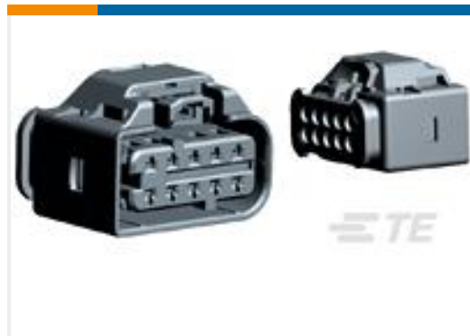
TE Part # 1801600-2 RECEPTACLE HOUSING, MCON, 10 W, SEALED