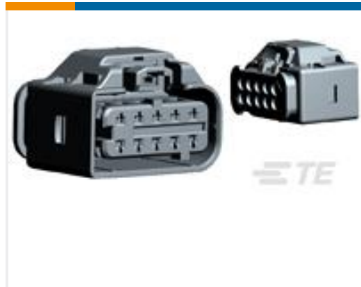
TE Part # 1801600-1 RECEPTACLE HOUSING, MCON, 10 W, SEALED