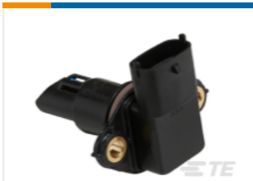
TE Part # HPP816E031 TRICAN 12V HTD2800P1B11C6STD