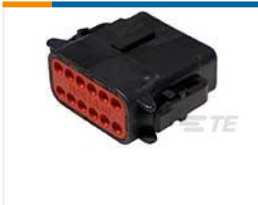
TE Part # DTM06-12SB PLG, 12P, BLK, N, B