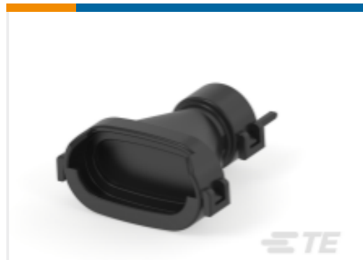
TE Part # 2050780-2 COVER FOR 4P SENSOR CONNECTOR