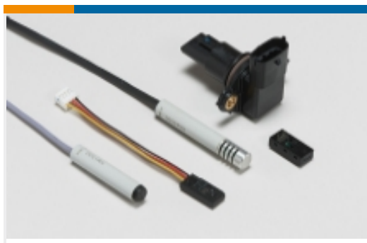
Humidity Sensor Assemblies(3)