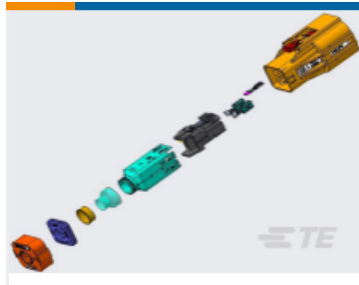
TE Part # YHVA630-2PHM-6MM-A HVA630-2phm,6sqmm,Key A