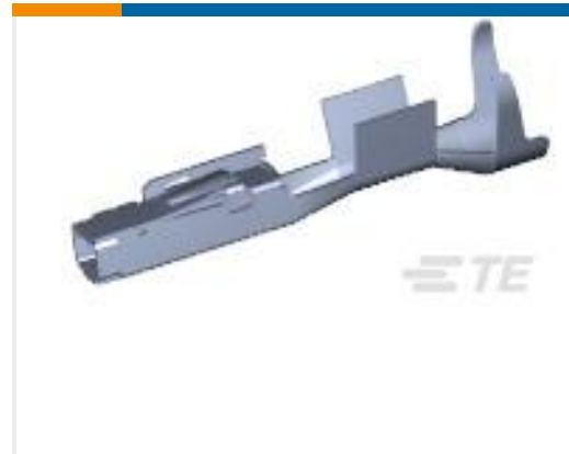
TE Part # 7-1452671-1 MCON 1.2 LL REC SWS SN