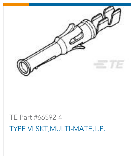
TE Part #66592-4 TYPE VI SKT,MULTI-MATE,L.P.