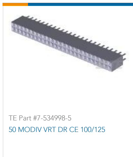
TE Part #7-534998-5 50 MODIV VRT DR CE 100/125