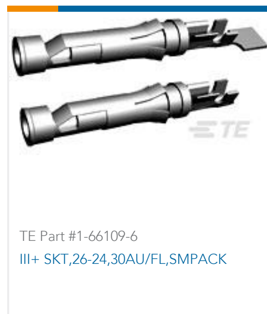
TE Part #1-66109-6 III+ SKT,26-24,30AU/FL,SMPACK