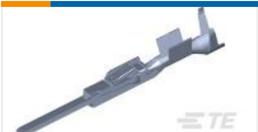
TE Part #1718762-3 MCON 1.2 LL TAB SWS AG