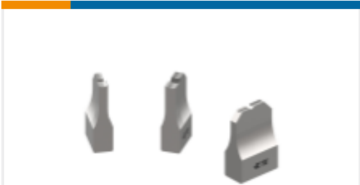
ANVIL REPRESENTATION ONLY TE Part #3-1803703-5 ANVIL, COMBINATION