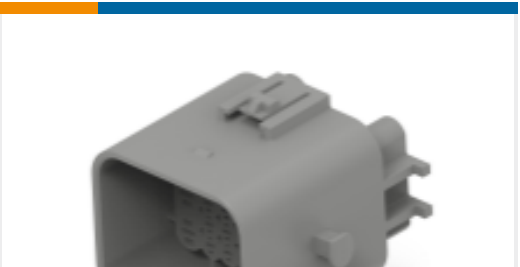
TE Part #1897013-3 MT-2/JPT SLD 26P CAP HSG GRY