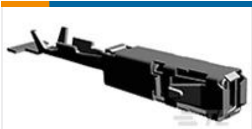
TE Part #1418884-1 AMP MCP 1.5K, CONTACT, SWS