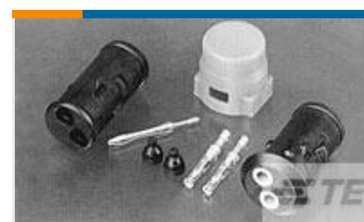
TE Part # 1-826884-2 2N ECONOSEAL F