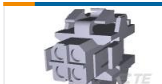
TE Part # 207015-1 HSG, PLUG, 4 POSN, SM METRIC