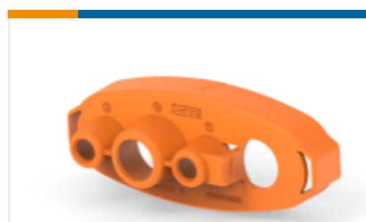
TE Part # 2316424-1 COVER, CABLE SEAL, AC