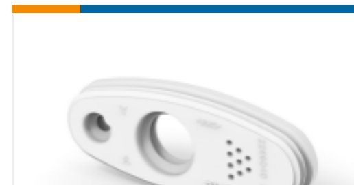
TE Part # 2-2296040-7 FAMILY SEAL, AC, 3PH