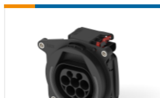
TE Part # 9-2368472-2 TYPE 2, CHARGE INLET ASSY, GENERAL