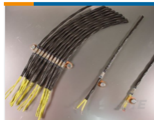
TE Part # 691437-000 B-500-06-01