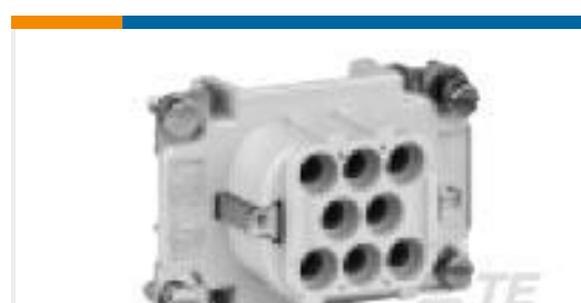
TE Part # 2-1104002-3 HVT.8.BU.C