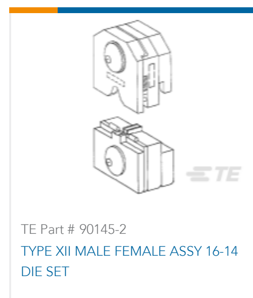
TE Part # 90145-2 TYPE XII MALE FEMALE ASSY 16-14 DIE SET