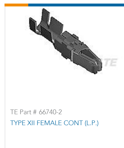
TE Part # 66740-2 TYPE XII FEMALE CONT (L.P.)