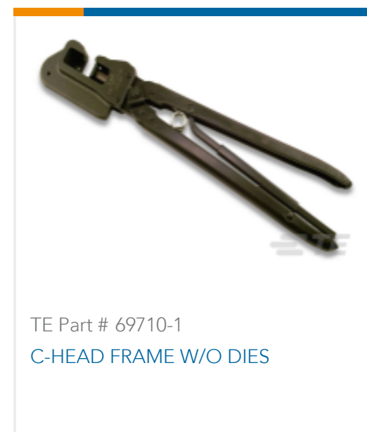
TE Part # 69710-1 C-HEAD FRAME W/O DIES