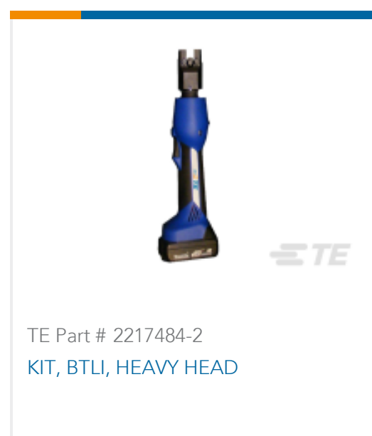
TE Part # 2217484-2 KIT, BTLI, HEAVY HEAD