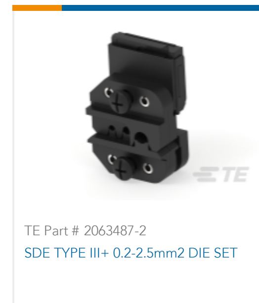
TE Part # 2063487-2 SDE TYPE III+ 0.2-2.5mm 2 DIE SET