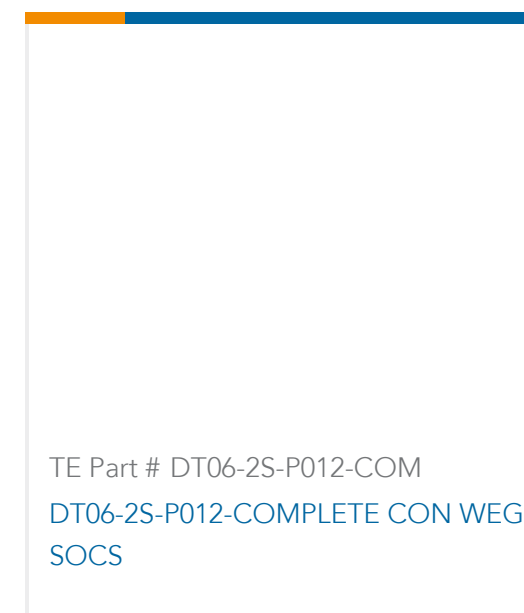
TE Part # DT06-2S-P012-COM DT06-2S-P012-COMplete CON WEG SOCS