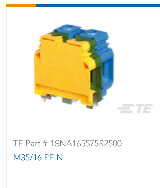
TE Part # 1SNA165575R2500 M35/16.PE.N