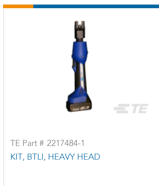
TE Part # 2217484-1 KIT, BTLI, HEAVY HEAD