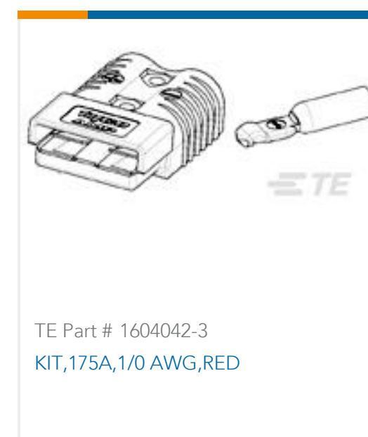
TE Part # 1604042-3 KIT,175A,1/0 AWG,RED