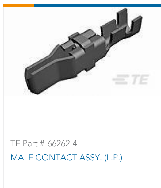
TE Part # 66262-4 MALE CONTACT ASSY. (L.P.)