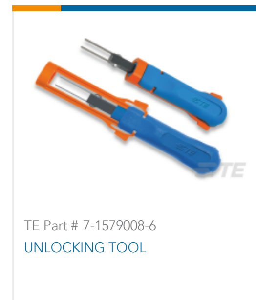
TE Part # 7-1579008-6 UNLOCKING TOOL