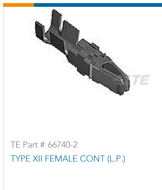
TE Part # 66740-2 TYPE XII FEMALE CONT (L.P.)