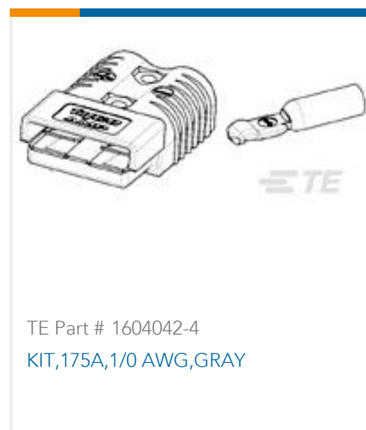
TE Part # 1604042-4 KIT,175A,1/0 AWG,GRAY