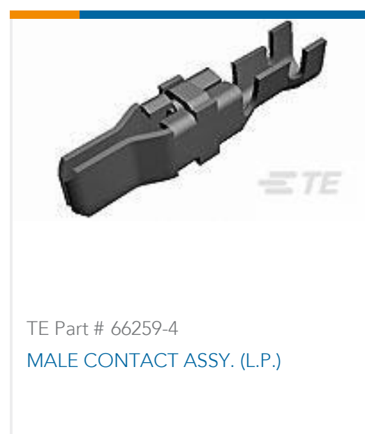
TE Part # 66259-4 MALE CONTACT ASSY. (L.P.)