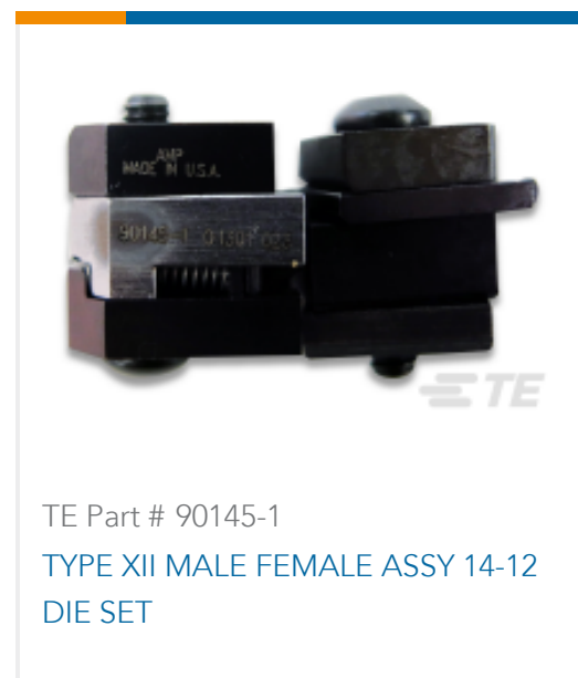
TE Part # 90145-1 TYPE XII MALE FEMALE ASSY 14-12 DIE SET