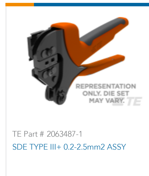
TE Part # 2063487-1 SDE TYPE III+ 0.2-2.5mm 2 ASSY