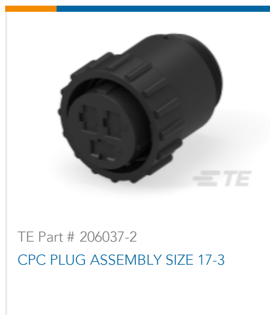
TE Part # 206037-2 CPC PLUG ASSEMBLY SIZE 17-3