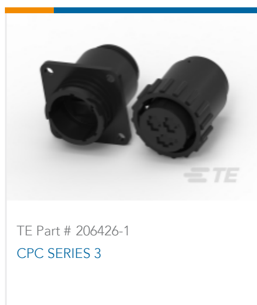
TE Part # 206426-1 CPC SERIES 3