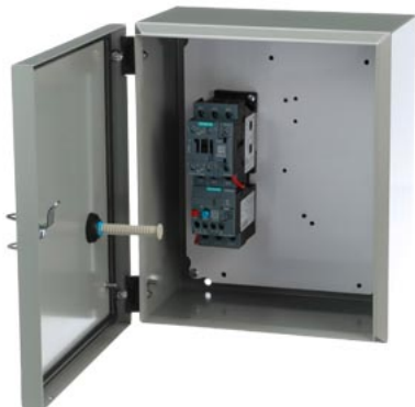
STARTER, 3RE41227CA354QY0, WITH MODS