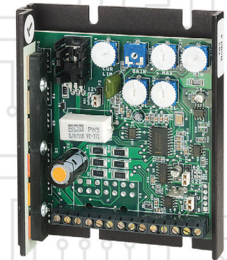
730 BDC Series