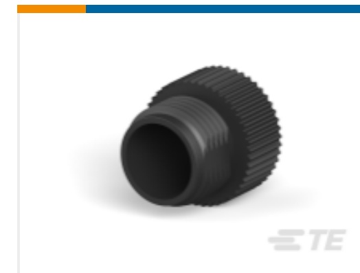
TE Part # 2823064-1 M12-DUST CAP-FEMALE CONN-IP67- W/O SLEEVE