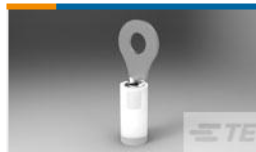
TE Part # 323986 TERMINAL,PIDG R 24-20 6