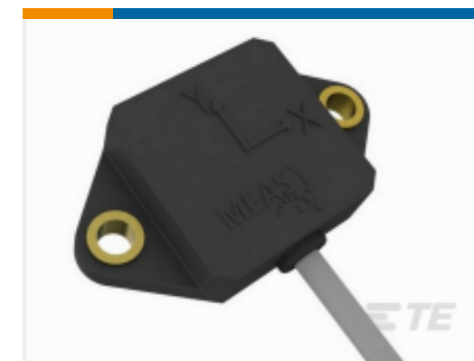
TE Part # G-NSDOG1-006 AXISENSE-1 V-OUT-180 TILT SENSOR