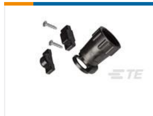
TE Part # 206966-7 CABLE SHELL CLAMP SIZE 13