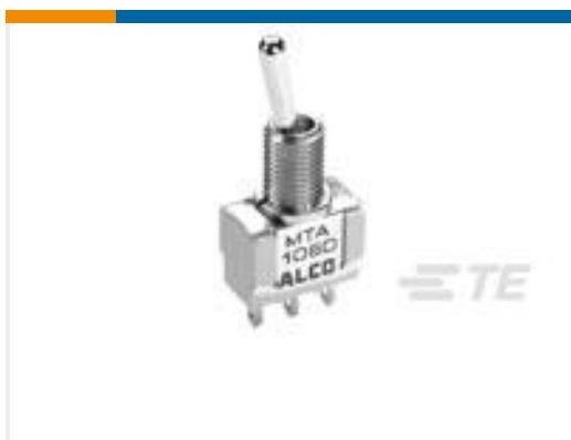
TE Part # 1-1437558-6 MTA106G=(MSTA) SWITCH TOGGLE S