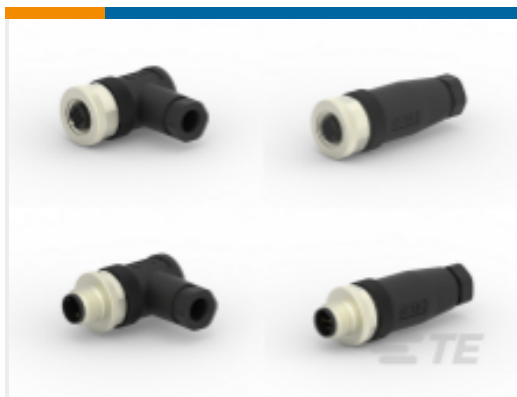
TE Part # T4111001051-000 M12 Field Installable Unshielded