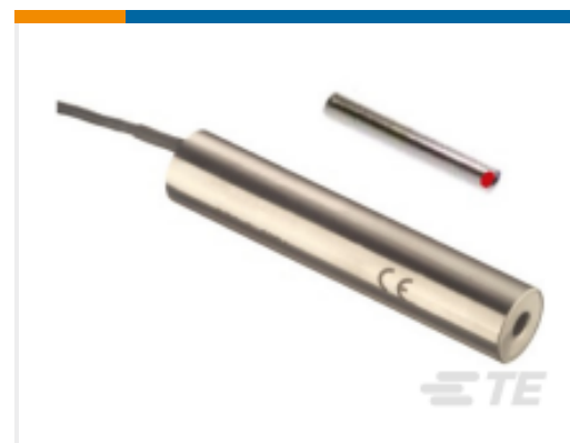
TE Part # 02560993-000 LVDT DC-SE 1000