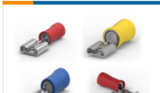
TE Part # 640903-1 PIDG FASTON Receptacle Quick Disconnects