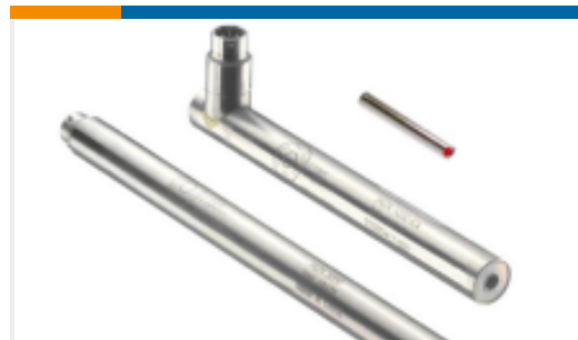
TE Part # 02560413-000 LVDT HCA 050 ASSY