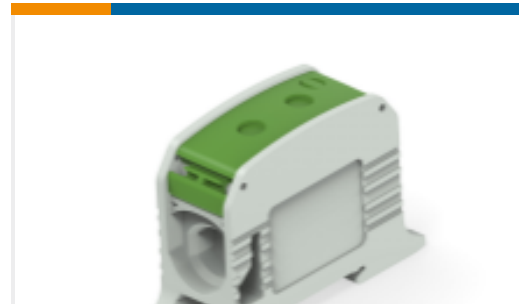
TE Part # 1SNF526031R0000 CBS95-2P-GR