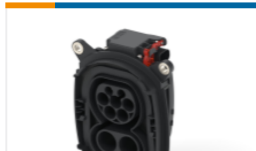
TE Part # 9-2337016-2 COMBO 2,CHARGE INLET ASSY, GENERAL