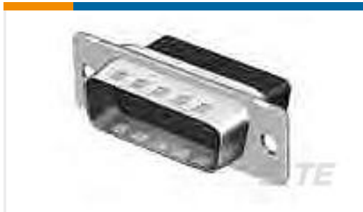
TE Part # 205206-9 CRIMP SNAP PLUG ASSY, SIZE 2