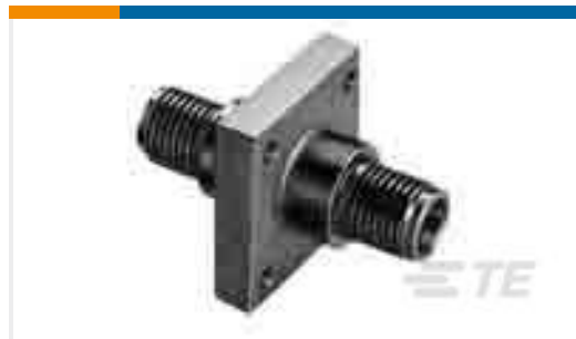
TE Part # 858857-1 LGH-1/2L FLANGED RECEPT.