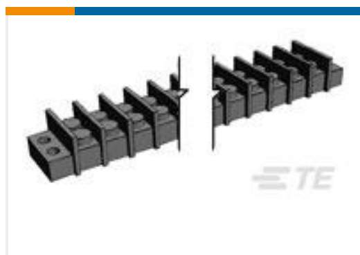
TE Part # 1-1546306-2 12P.374" DR BARRIER STRIP