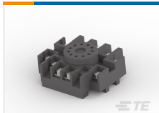
TE Part # 2-1419106-4 27E892=SOCKET,KRPA,11,OCTAL,PO