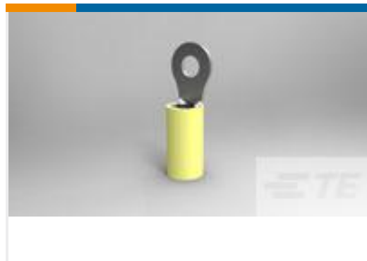
TE Part # 321021 PIDG RING (26-22)