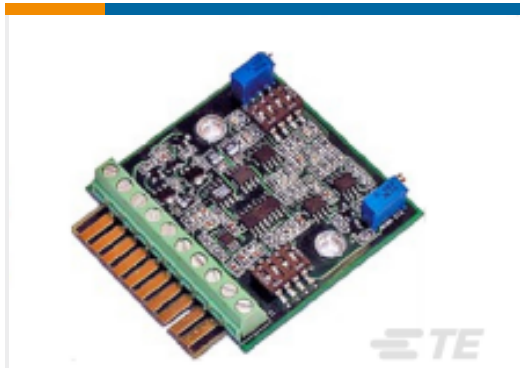
TE Part # 04171776-000 LVM-110 AMP/DEMODO BD ASSY