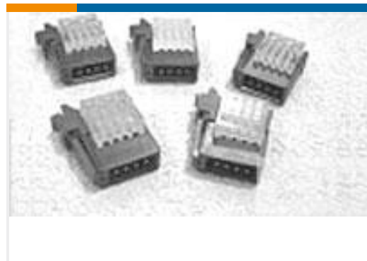
TE Part # 1473562-3 RITS CONN. PLUG ASSY 3P YELLOW