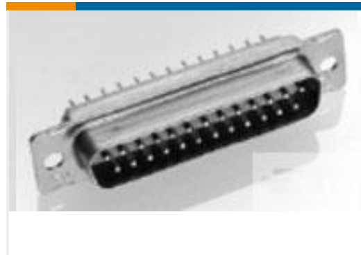
TE Part # 1757819-2 AMPLIMITE,ASY,PLUG,STD,109,ZN,2