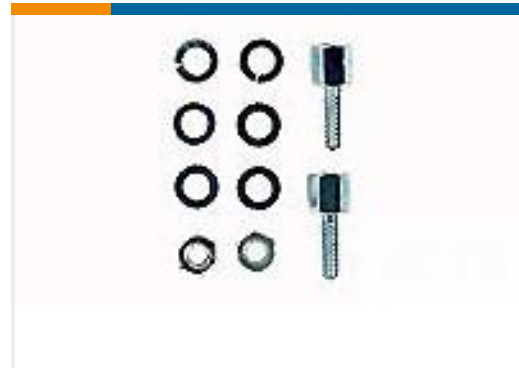
TE Part # 5207952-3 KIT SCREWLOCK FEMALE