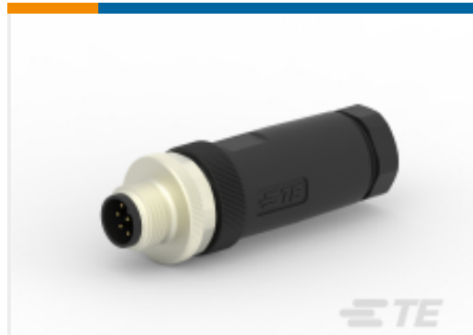
TE Part # T4111002081-000 M12,MALE,STRAIGHT,A CODE,8P,PG9,GOLD