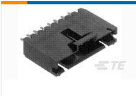
TE Part # 5-103669-3 04 MTE HDR SRST LATCH W/HLDWN