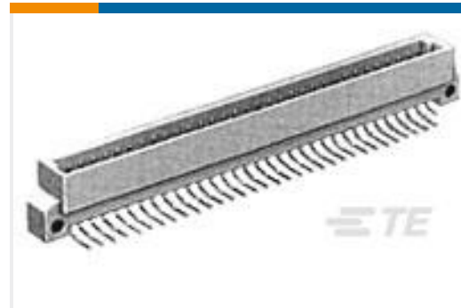
TE Part # 6-1393644-6 V42254B1200B640=PC612 MESSERLE