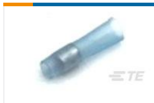
TE Part # 625246-000 D-110-0068