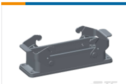
TE Part # T1410242000-000 H24B-AG