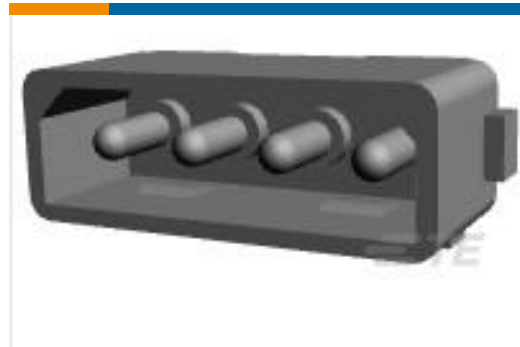
TE Part # 350211-1 04P CMNL HDR ASSY PC