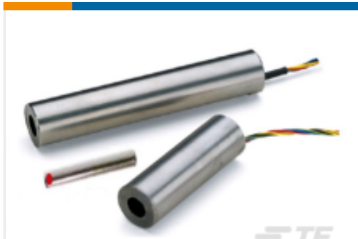
TE Part # 02560394-000 LVDT HR 500 ASSY