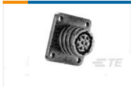
TE Part # 206433-1 CPC RECPT ASSEMBLY SIZE 11-8