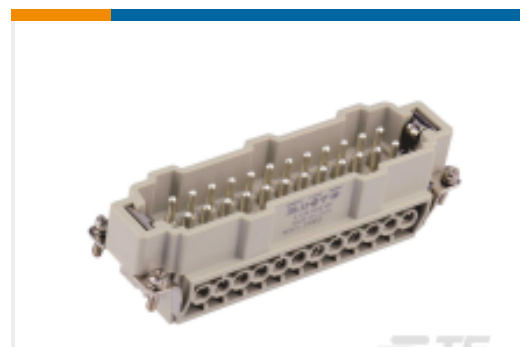
TE Part # T2040242101-000 HE-024-M