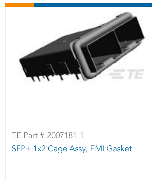
TE Part # 2007181-1 SFP+ 1x2 Cage Assy, EMI Gasket