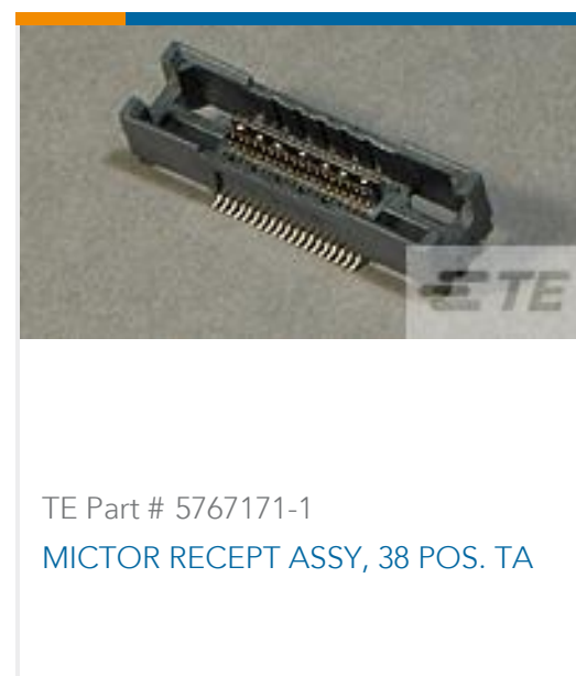
TE Part # 5767171-1 MICTOR RECEPT ASSY, 38 POS. TA