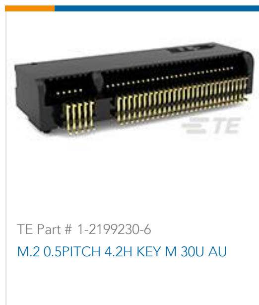
TE Part # 1-2199230-6 M.2 0.5PITCH 4.2H KEY M 30U AU