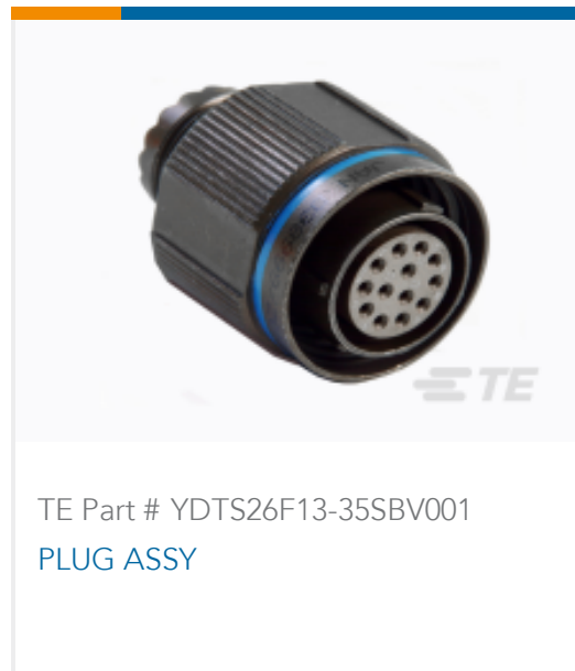
TE Part # YDTS26F13-35SBV001 PLUG ASSY