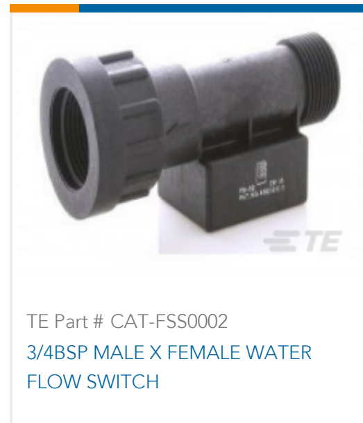
TE Part # CAT-FSS0002 3/4BSP MALE X FEMALE WATER FLOW SWITCH