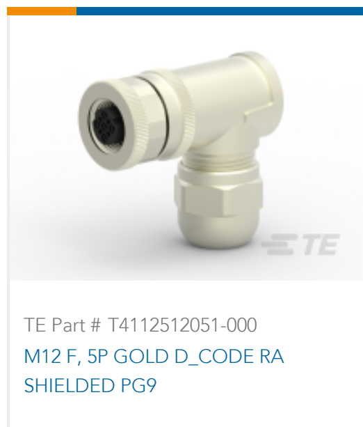
TE Part # T4112512051-000 M12 F, 5P GOLD D_CODE RA SHIELDED PG9