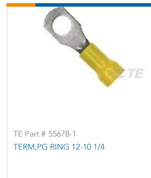
TE Part # 55678-1 TERM,PG RING 12-10 1/4