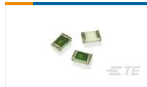
TE Part #1676639-2 RN 0805 10R 0.1% 10PPM 1K RL