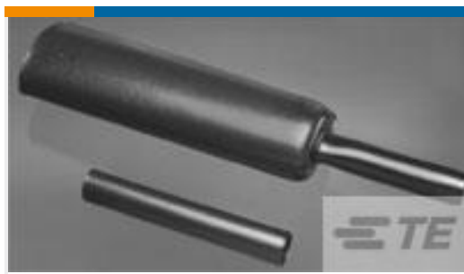
TE Part #166916-000 RMW-63/19-1200/ADH-0