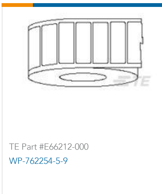
TE Part #E66212-000 WP-762254-5-9