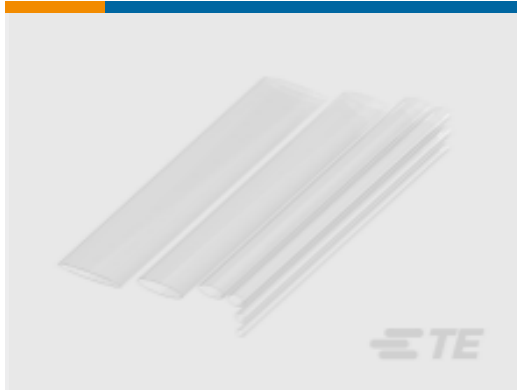
TE Part #NB19234001 RNF-100-CL Heat Shrink Tubing