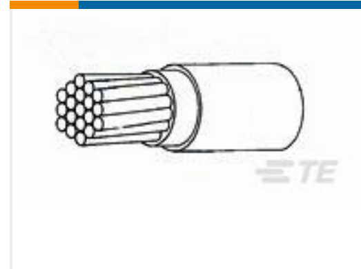
TE Part #2820333007 44A0111-22-3