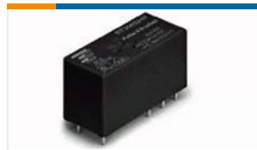
TE Part #2-1393237-7 RT334024F