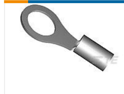
TE Part #322418 BUDG R 22-16 COMM 22-18 MIL 4