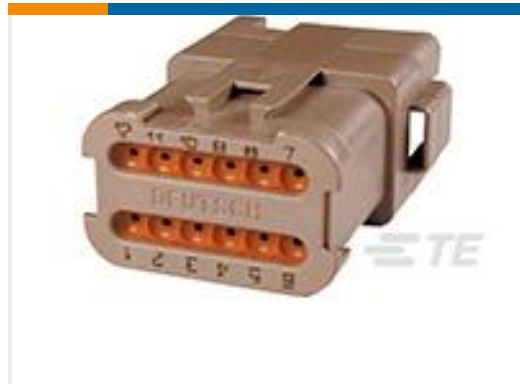
TE Part # DT04-12PD-BE02 REC, 12P, BRN, N, ENH KEY, CAP, D