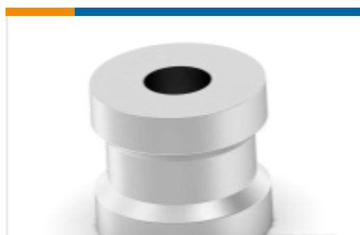
TE Part # 225859-E POWELM BUCHSE * M6 6,5 ** SMD 11,5 SN *