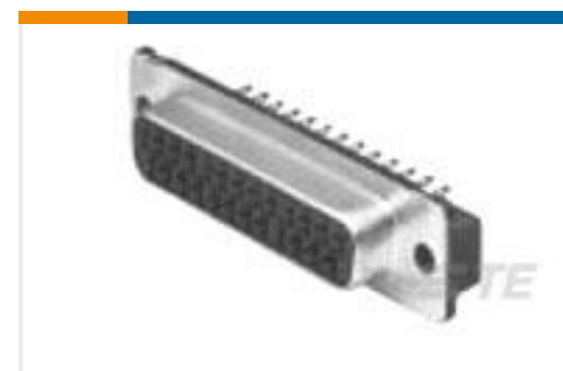
TE Part # 5747714-2 37 RCPT ACT PIN/MS MED INSRT