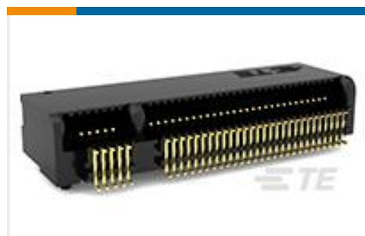
TE Part # 1-2199230-5 M.2 0.5PITCH 4.2H KEY M 15U" AU