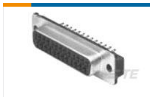
TE Part # 5747141-2 15 RCPT ACT PIN/MS MED INSRT