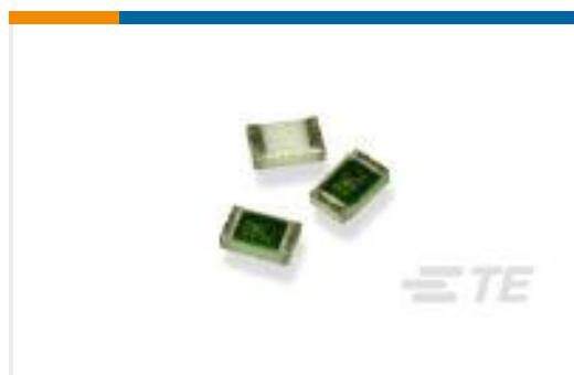
TE Part # 8-1879215-6 CPF 0402 35K7 0.1% 25PPM 1K RL