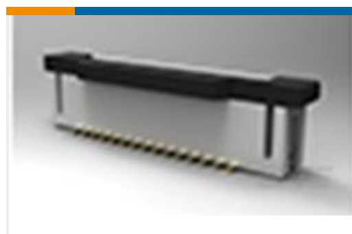
TE Part # 1-1734248-5 1.0 FPC, ZIF V/T, SMT, 15P