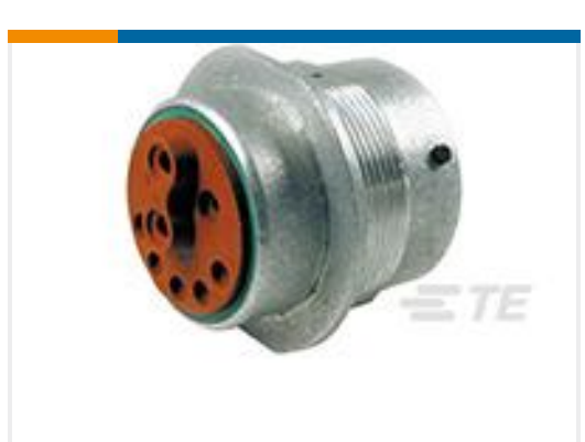
TE Part # HD34-24-91PN REC, 9P, AL, N, 8/12/16, P