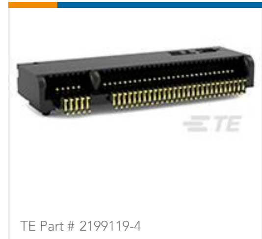
M.2 0.5PITCH 3.2H KEY E 15U" AU