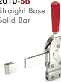
2010-SB Straight Base Solid Bar