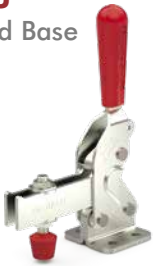
2010-U Flanged Base U-Bar