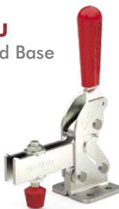
2010-U Flanged Base U-Bar