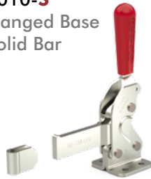
2010-S Flanged Base Solid Bar