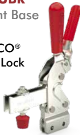
2010-UBR Straight Base U-Bar DESTACO® Toggle Lock Plus