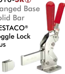
2010-SR ⓘ Flanged Base Solid Bar DESTACO® Toggle Lock Plus