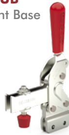
2010-UB Straight Base U-Bar