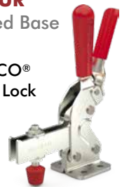
2010-UR Flanged Base U-Bar DESTACO® Toggle Lock Plus