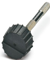
Fillister head screw with plastic knurl, M3 x 40

Please be informed that the data shown in this PDF document is generated from our online catalog. Please find the complete data in the user documentation. Our general terms of use for downloads are valid.