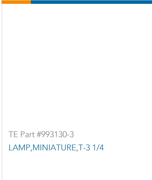
TE Part #993130-3 LAMP,MINIATURE,T-3 1/4