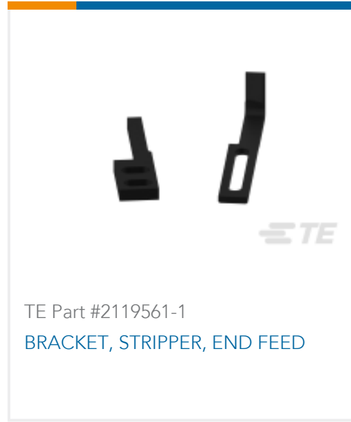
TE Part #2119561-1 BRACKET, STRIPPER, END FEED