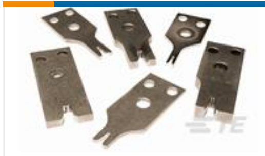
TE Part #459585-1 CRIMPER ANVILVAR SPLICE