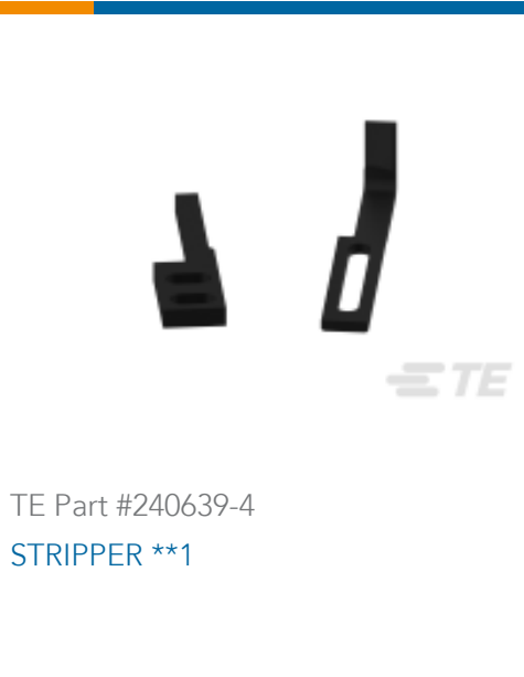
TE Part #240639-4 STRIPPER **1