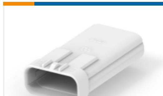
TE Part # 2443725-4 CAP HOUSING FREE HANGING 4PIN