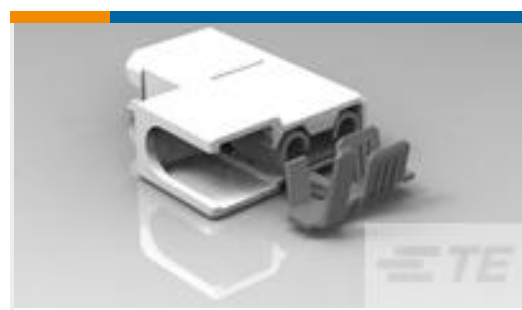
TE Part # 521282-2 ULTRA-POD 250 ASSY REC 18-14 AWG TPBR