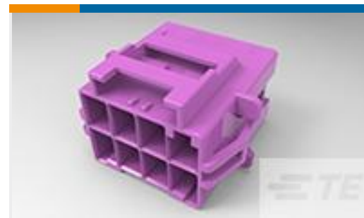
TE Part # 2-1971775-4 PTL 2X4 CAP PANEL MT STD TEMP KEY B PUR