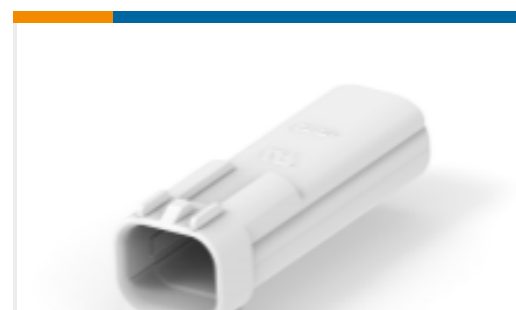
TE Part # 2443725-2 CAP HOUSING FREE HANGING 2PIN