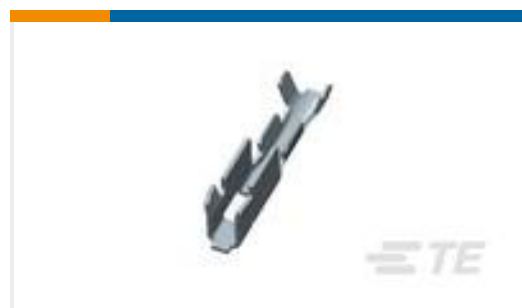
TE Part # 1599105-1 RECEPTACLE CLUSTER PIN .090dia