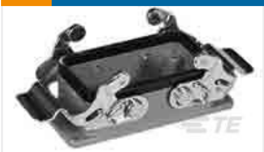
TE Part # 1-1102296-1 HB.16.AG-VS