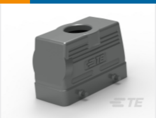
TE Part # T1220160121-000 H16B-TG-PG21