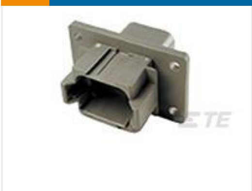
TE Part # DT04-08PA-L012 REC, 8P, GRY, N, FLANGE, A