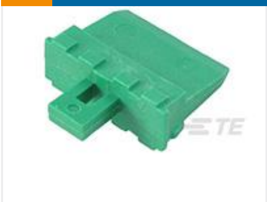
TE Part # W8P WEDGE LOCK, 8P, REC, GRN, DT