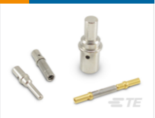
TE Part # 0462-201-20141 DEUTSCH Solid Contacts