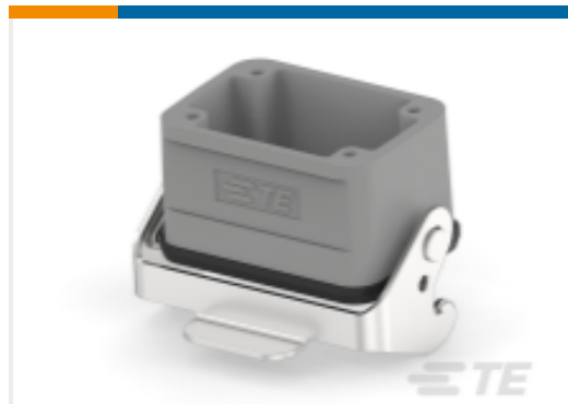
TE Part # T1730060000-000 H6B-TBF-T