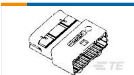
TE Part # 1473203-1 025 CAP ASSY 16P P/BACK BRCKT