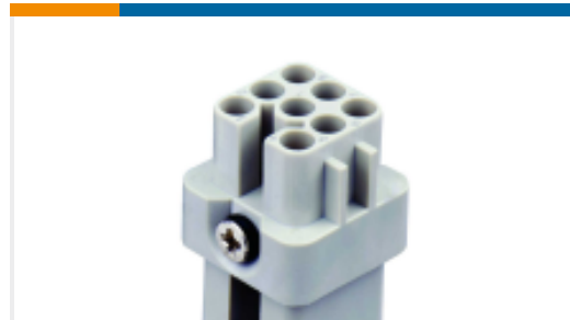
TE Part # T2020082201-000 HD-008-F