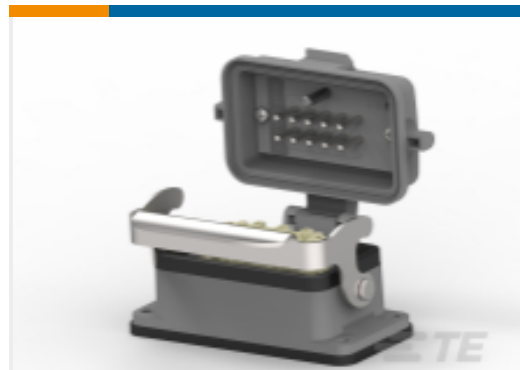
TE Part # T2120100219-000 ZGG-10DSTK,1-7,2-8,3-9,4-6,5-10