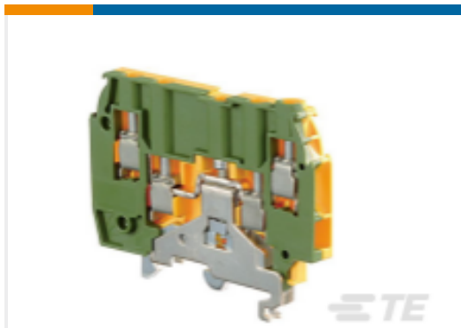
TE Part # 1SNA195638R2300 M4/6.4A.P