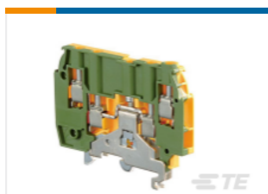
TE Part # 1SNA195638R2300 M4/6.4A.P