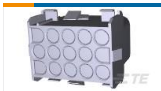
TE Part # 1-480711-9 15P UMNL CAP HSG BLK