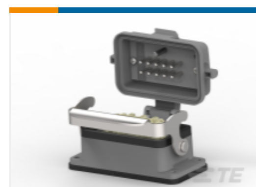
TE Part # T2120100219-000 ZGG-10DSTK,1-7,2-8,3-9,4-6,5-10