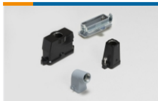
Rectangular Connector Hoods & Bases (1258)