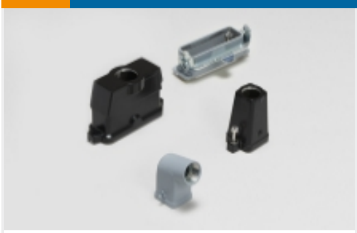
Rectangular Connector Hoods & Bases (4)