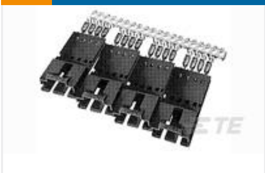
TE Part # 5-103945-3 4X4 MTE SHRD PIN SR LATCH .100