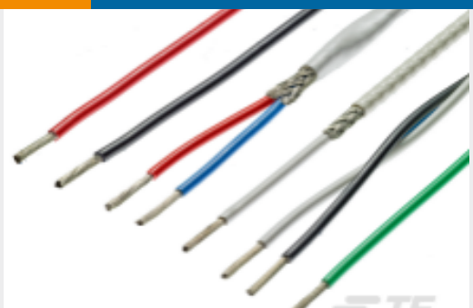
TE Part # C906593001 FLHTC0311-0.25-0