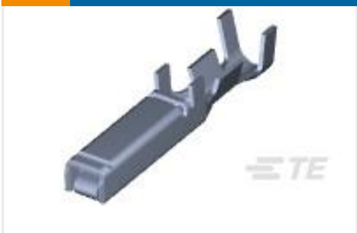
TE Part # 1-175195-3 DYNAMIC D-3 REC CONT/M AU 0.76