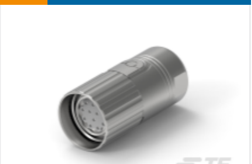
TE Part # ASA021N00100235000 623 PLUG