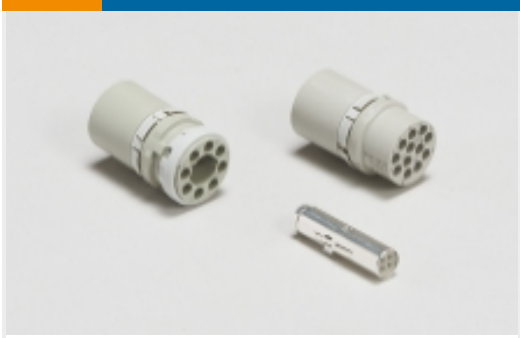
Circular Connector Contact Inserts(2)