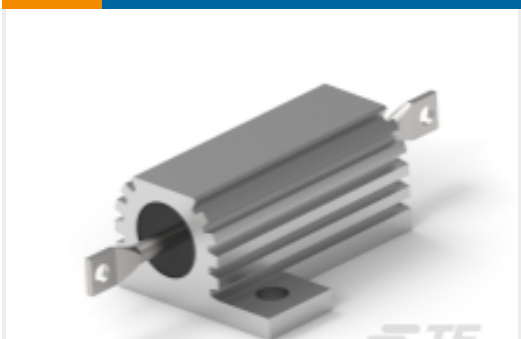
TE Part # 1879363-1 Power Resistor: Aluminum Housed, 75 Watt