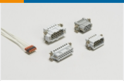
Rectangular Contact Inserts(5)