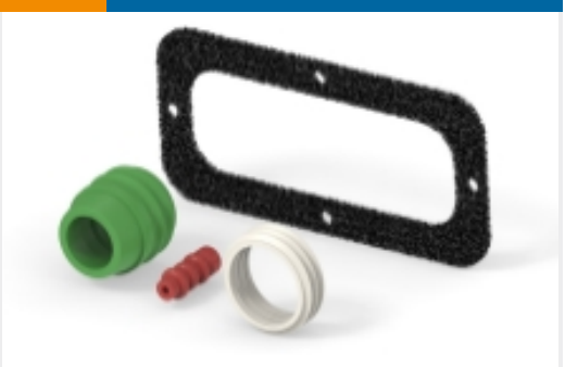
Connector Seals & Cavity Plugs(2)