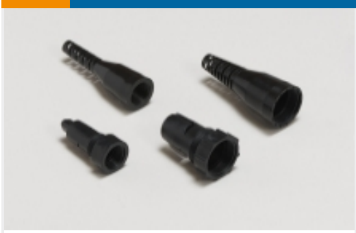
Connector Strain Relief(2)