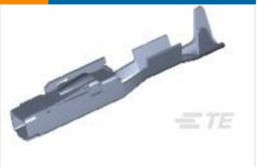
TE Part # 7-1452653-2 MCON 1.2 LL REC SRC AU