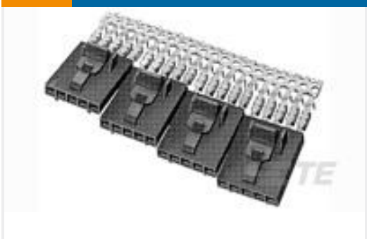
TE Part # 5-103957-2 8X3 MTE RCPT SR LATCH .100CL