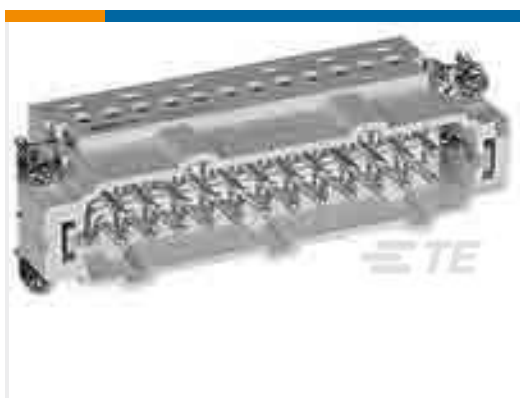
TE Part # 1-1103640-1 HE.24.STI.S.1-24