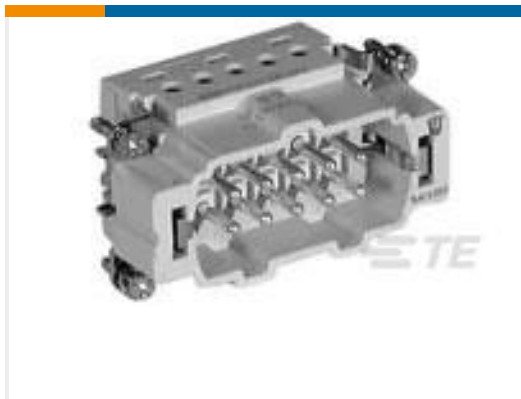
TE Part # 1-1103636-1 HE.10.STI.S