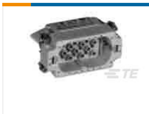
TE Part # 2-1103008-3 HD.24.STI.C