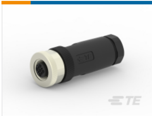
TE Part # T4110002051-000 M12,FEMALE,STRAIGHT,A CODE,5P, PG9,GOLD