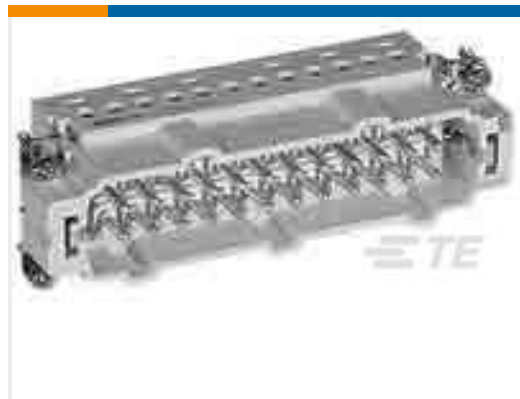
TE Part # 1-1103640-8 HE24STI S-T.B12+6+6