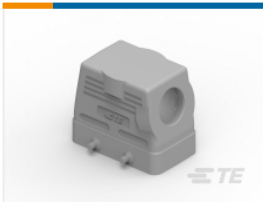
TE Part # T1210104125-000 H10B-TS-M25