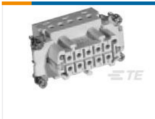
TE Part # 1-1103637-1 HE.10.BU.S