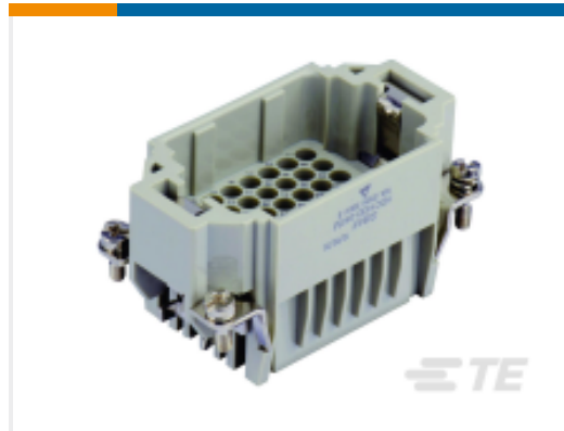
TE Part # T2030422101-000 HDD-042-M