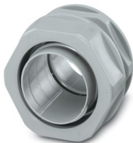
Cable gland made from PP with metric thread, IP65 protection

https://www.phoenixcontact.com/us/products/3241001