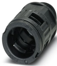
Cable gland, metric thread, IP66 protection, straight

https://www.phoenixcontact.com/us/products/3240898