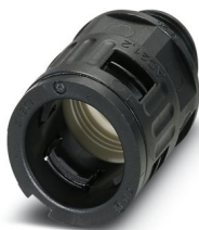
Cable gland, metric thread, IP68/69k protection, straight

https://www.phoenixcontact.com/us/products/3240884