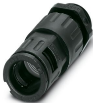
Cable gland, metric thread, IP68/69k protection, with strain relief

https://www.phoenixcontact.com/us/products/3240940