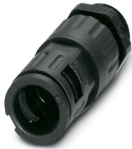
Cable gland, metric thread, IP66 protection, with strain relief

https://www.phoenixcontact.com/us/products/3240954