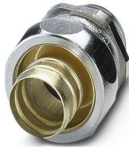
Cable gland made from brass with metric thread, IP65 protection

https://www.phoenixcontact.com/us/products/3241061