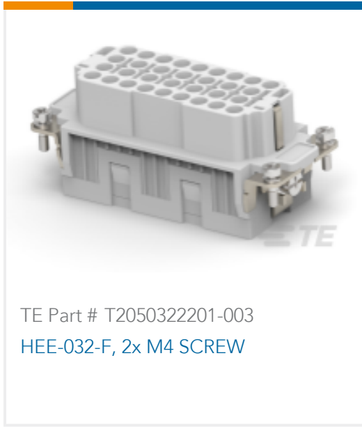
TE Part # T2050322201-003 HEE-032-F, 2x M4 SCREW