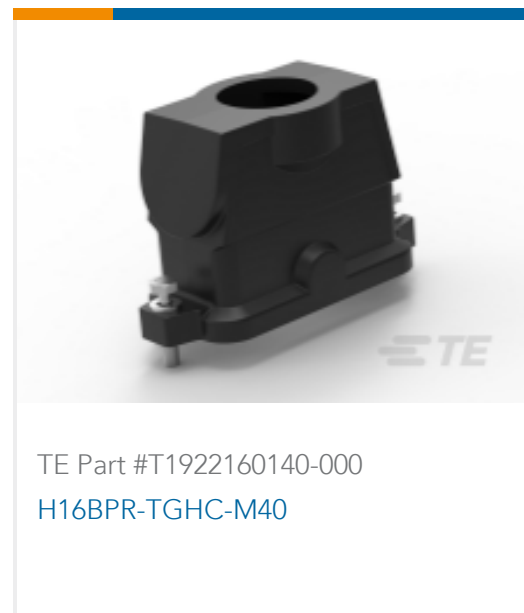
TE Part #T1922160140-000 H16BPR-TGHC-M40