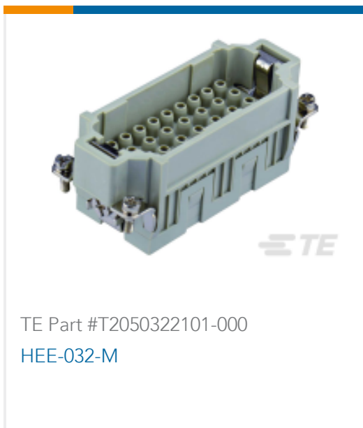
TE Part #T2050322101-000 HEE-032-M