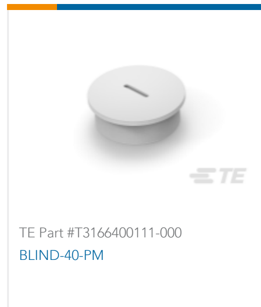
TE Part #T3166400111-000 BLIND-40-PM