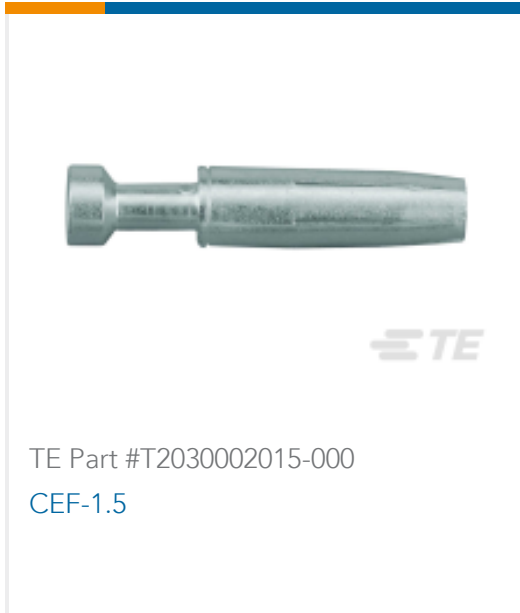
TE Part #T2030002015-000 CEF-1.5