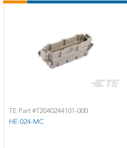
TE Part #T2040244101-000 HE-024-MC