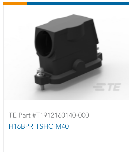
TE Part #T1912160140-000 H16BPR-TSHC-M40