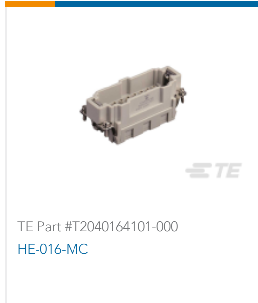
TE Part #T2040164101-000 HE-016-MC