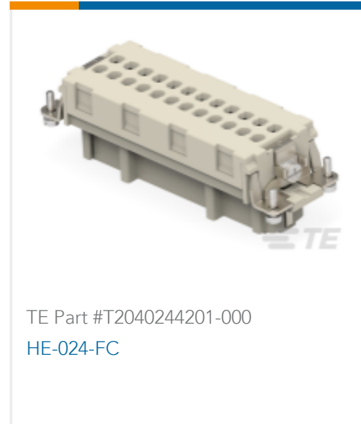
TE Part #T2040244201-000 HE-024-FC