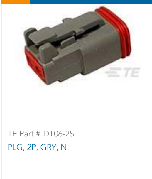
TE Part # DT06-2S PLG, 2P, GRY, N