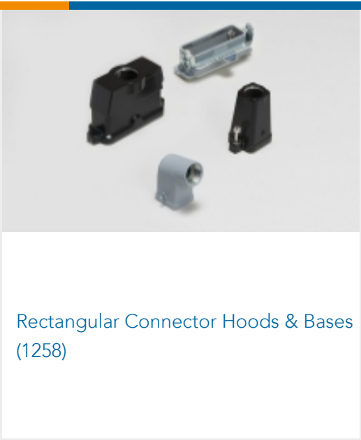
Rectangular Connector Hoods & Bases (1258)