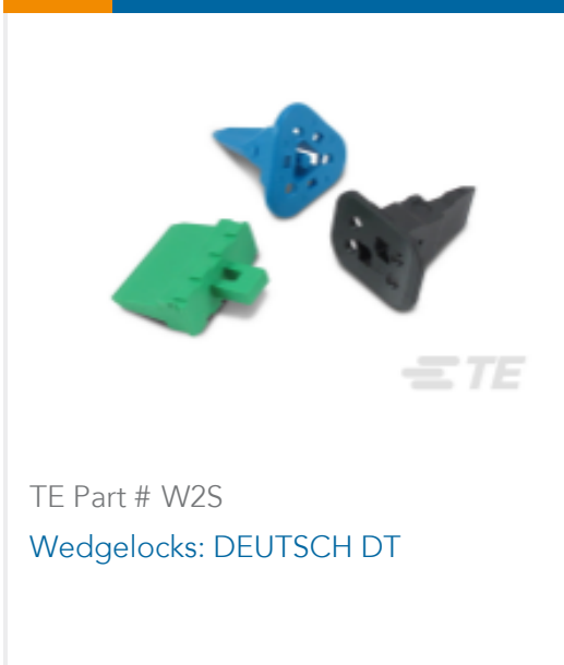
TE Part # W2S Wedgelocks: DEUTSCH DT