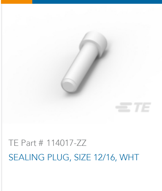
TE Part # 114017-ZZ SEALING PLUG, SIZE 12/16, WHT