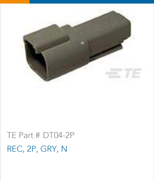
TE Part # DT04-2P REC, 2P, GRY, N