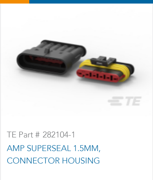
TE Part # 282104-1 AMP SUPERSEAL 1.5MM, CONNECTOR HOUSING